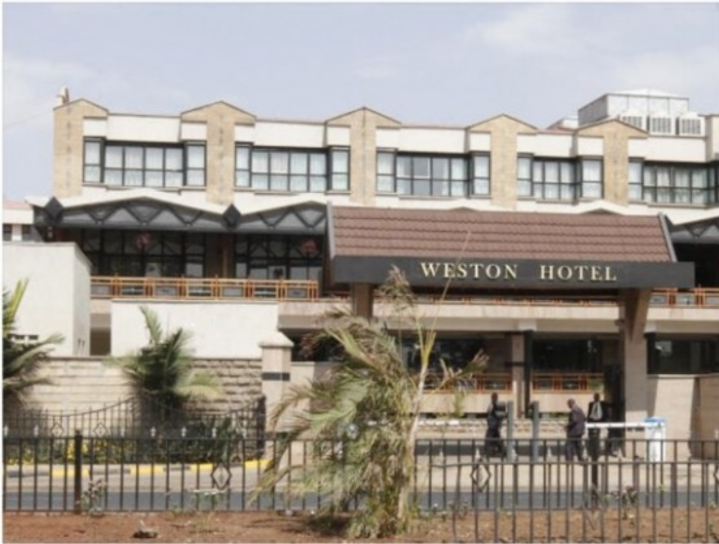
A file photo of Weston Hotel, January 2015.

The land on which Deputy President William Ruto's Weston Hotel stands was grabbed from the Kenya Civil Aviation Authority, evidence shows.